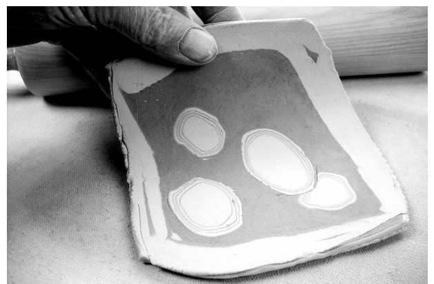
Finished slab, ready to form