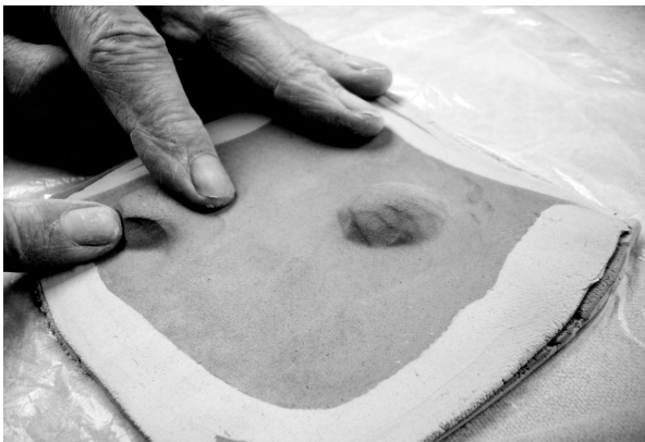
From front side, press clay around back pieces