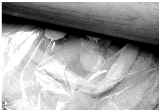
Cover with plastic, roll slab flat