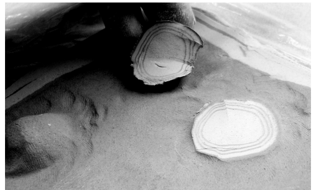
Place cut piece upside-down on slab