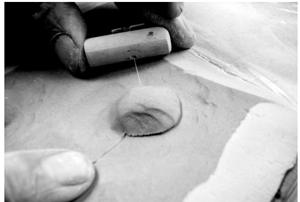
With a thin wire, cut off the protruding pieces