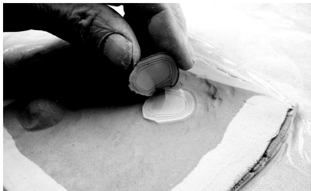
Remove the cut piece