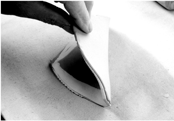
Turn layered slab over